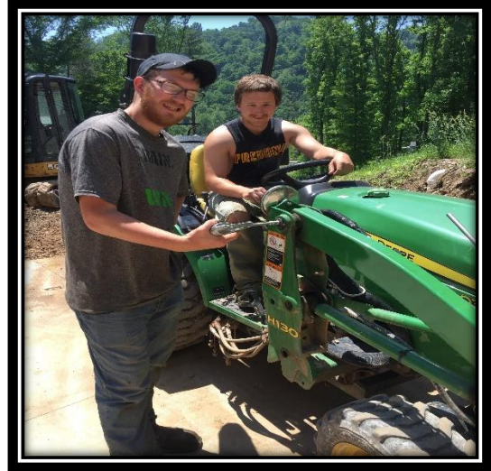
Wetzel County Commission – 4-H Worksite

to improve skills development opportunities, aligning work experience with career pathways, and building stronger employer partnerships.